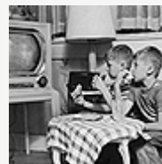
Photo: TV dinners in the 1950's Learn More.